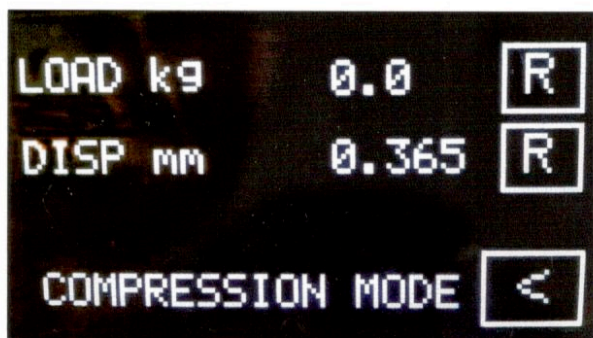
Result Screen - Compression Test