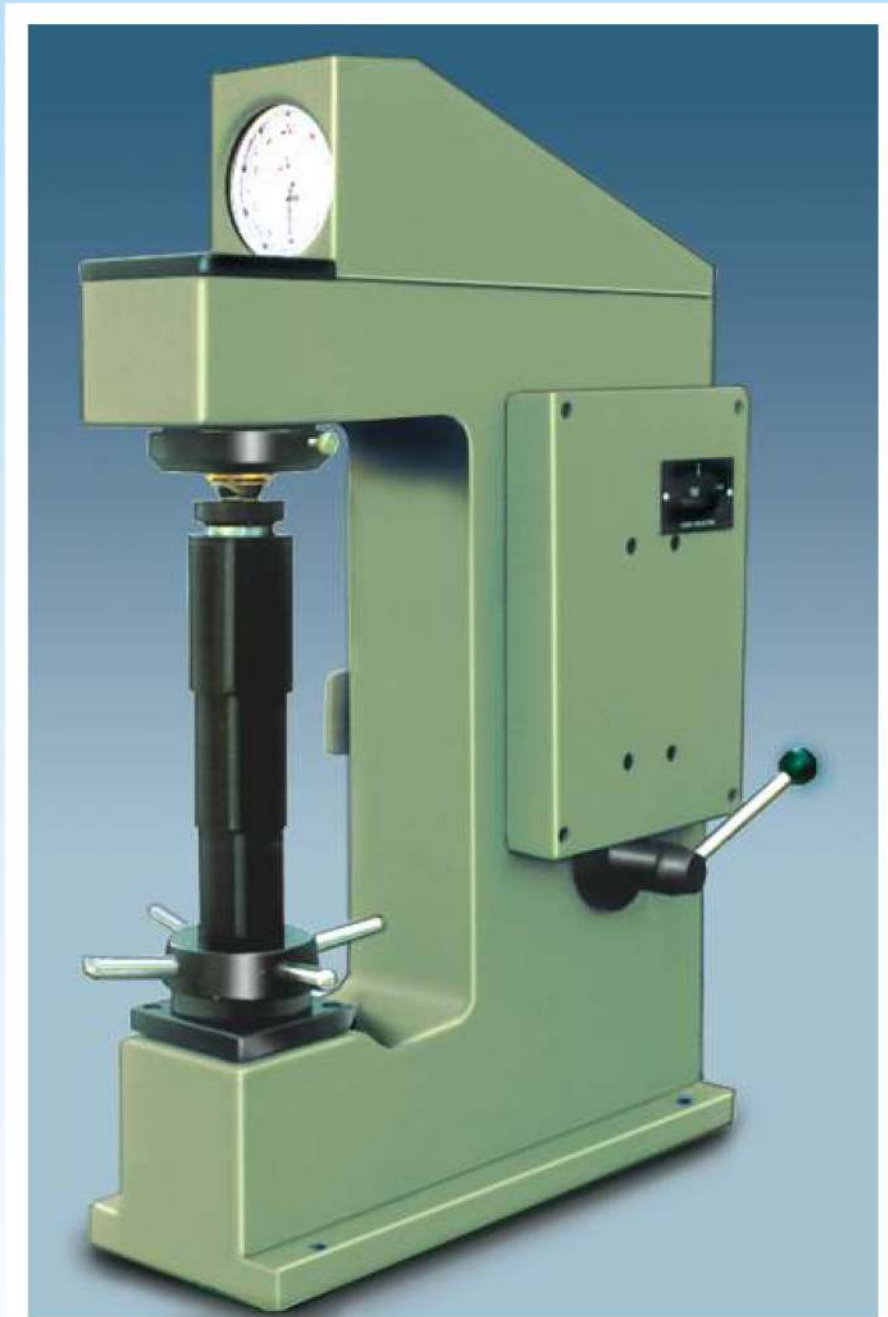
Model : RAS