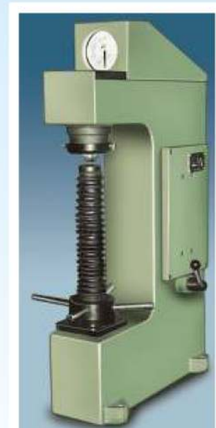
Model : RAB-250

ROCKWELL, ROCKWELL BRINELL COMBINED, ROCKWELL/ROCKWELL SUPERFICIAL COMBINED SYSTEM HARDNESS TESTERS