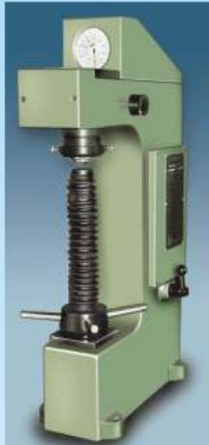
Model : TWIN