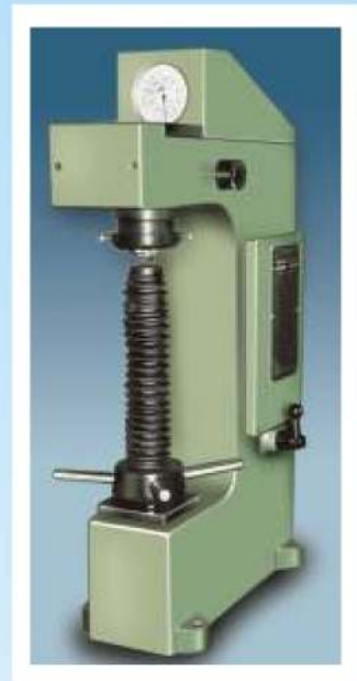
Model : TWIN