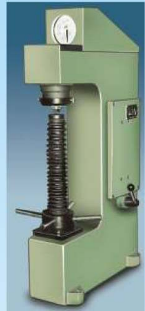
Model : RAB-250