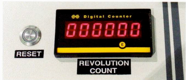
Revolution Counter & Reset